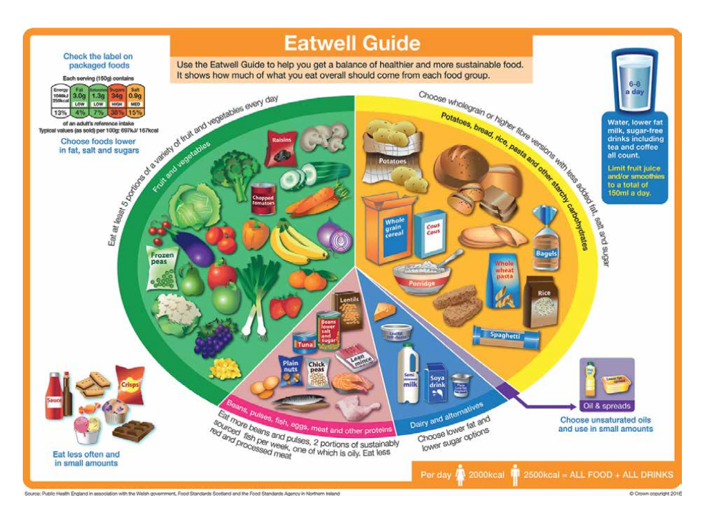
Figure 1. The Eatwell Guide UK 2016 [132].

The Eatwell Guide does not give specific guidance on how to achieve RNI of micronutrients within a vegetarian or vegan diet. Conversely, the guide does include