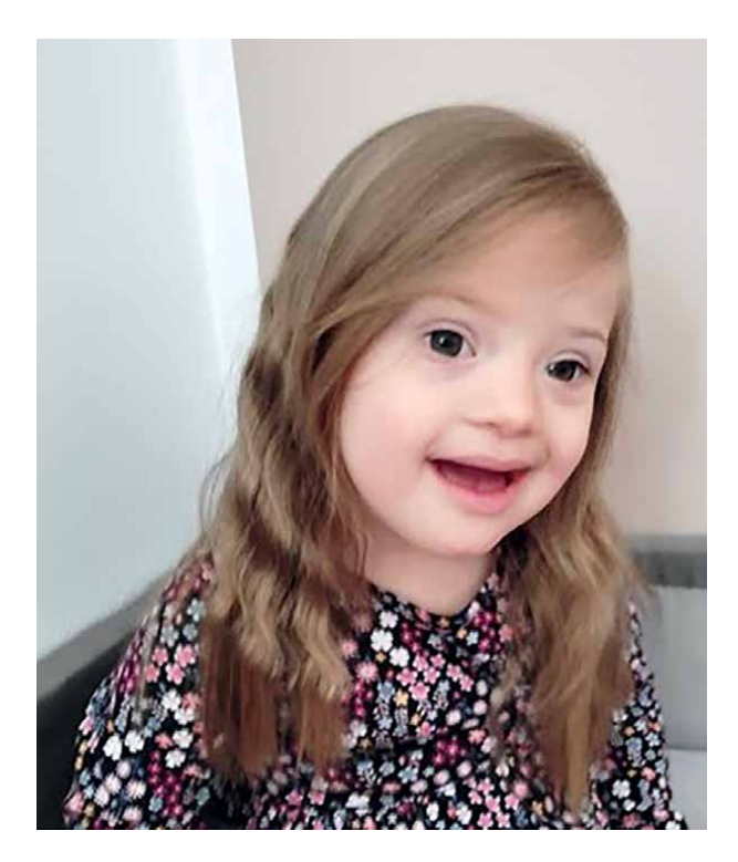
Figure 1. A three-year-old child with Down syndrome.

however, research on the benefits of their use is still very unsupported by concrete evidence that would give doctors guidance for their recommendation.